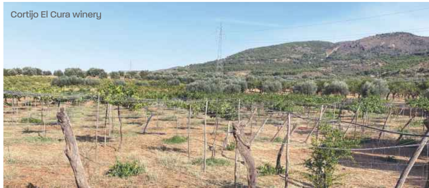
Cortijo El Cura winery

Additionally, Alpujarra is where the Padules Channels can be found, a haven of natural pools within a gorge separating Sierra Nevada and Sierra de Gádor.