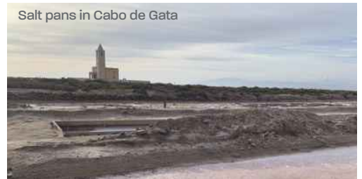
Salt pans in Cabo de Gata

Between the Sierra Nevada and the Sierra de Gádor in Laujar de Andarax, the Cortijo El Cura winery 69km from the port, offers visitors the chance to admire the landscape of the Sierra Nevada Natural Park from among almond, olive and fruit trees. Wine tasting accompanied by olives and almonds grown on the family farm follows a tour encompassing the barrels room where the best wines are kept. A small agricultural museum captures traditional farming methods. 50 cruise passengers may be accommodated at once, but the family-owned winery recommends groups of 20-30