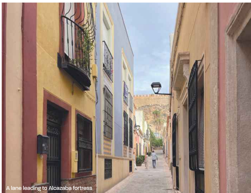
A lane leading to Alcazaba fortress

Outside of the city centre, roads weave their way between towering mountains scattered with olive trees and the occasional building, harking back to a time when the hills were inhabited.