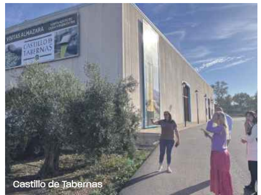
Castillo de Tabernas

visitors in order to provide a personal touch. A two-hour tour is recommended.