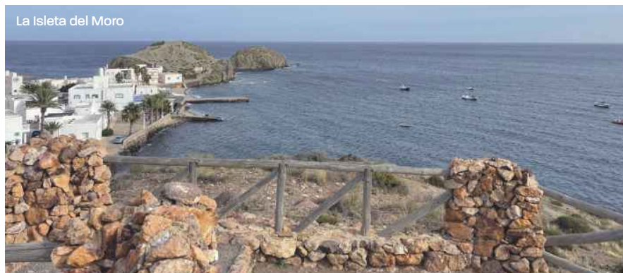
La Isleta del Moro