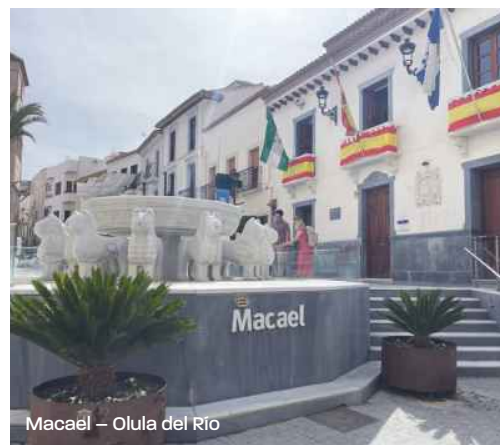
Macael – Olula del Río

As the brushland gives way to the Tabernas Desert, passengers can take a visit to Castillo de Tabernas olive mill less than 50km from the port to learn about the different varieties of olives, methods of oil extraction and see olive production in motion. After heading out into the olive groves, visitors have a chance to watch a film about olives and purchase various olive oil products.