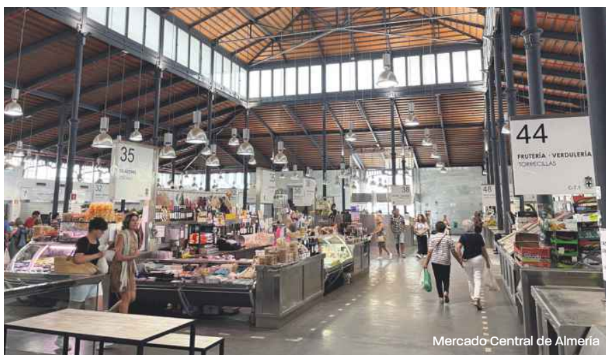
Mercado Central de Almería